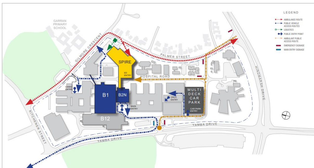
Figure 1: Canberra Hospital SPIRE Project - Access and Entry Review Study (November 2019)

As part of the master planning process, PTCBR strongly urges the ACT Government to develop a comprehensive transport plan for the Canberra Hospital precinct. This plan should identify and safeguard a long-term public transport route capable of supporting a frequent, high-capacity rapid service that provides stops close to the main clinical buildings. With the closure of Hospital Road, Palmer Street and Gilmore Crescent may prove to be a more suitable route for these purposes.